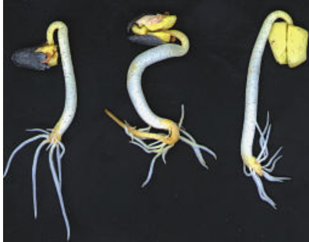
Cotton seedlings exhibiting chilling injury

The two seedlings below show normal root development. When the two groups are compared it may be noted that seedlings injured by chilling are often short with thickened hypocotyls and radicles, dead root tips, and show some signs of lateral root growth.