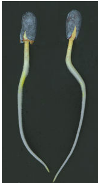
Normal cotton seedlings

The two seedlings below show normal root development. When the two groups are compared it may be noted that seedlings injured by chilling are often short with thickened hypocotyls and radicles, dead root tips, and show some signs of lateral root growth.