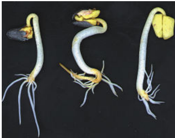
Cotton seedlings exhibiting chilling injury

The three seedlings below were subjected to chilling temperatures during the imbibition phase. During the first six hours of imbibition, the damaged seedlings were exposed to a temperature of 40 degrees F°. After the chilling period they were moved to a chamber set at 86 degrees F° for two to four days. The curling, shortening and thickening of the roots are typical of imbibitional chilling injury. The chilling during this phase of imbibition injures and typically kills the root tip meristematic tissue. This results in cessation of normal taproot growth. Subsequently, lateral roots develop to compensate for this loss. Typically these seedlings may survive and produce productive plants if additional stresses such as water deficit or disease are not encountered.